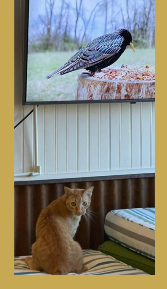
LITTLE ORANGE, needs love and trust