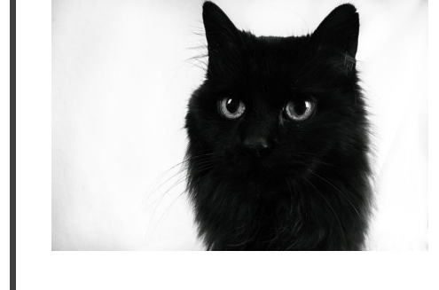
SKITTLES

donation from each couple to contribute to his continued care.