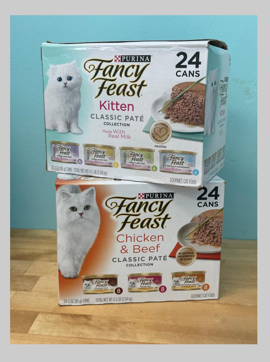
If you are interested in making a food contribution for the sanctuary cats, Fancy Feast is the brand of wet food used exclusively for our cats at Durango Cat Care.