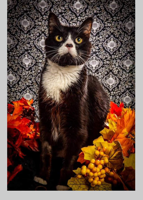
CHUBBY (Choo-bee)