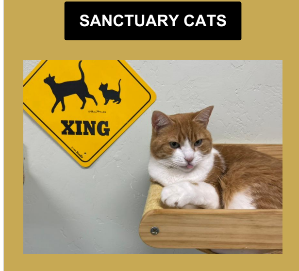
CHLOE, queen of the land