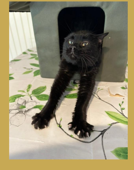
RUSH , a quiet gentleman